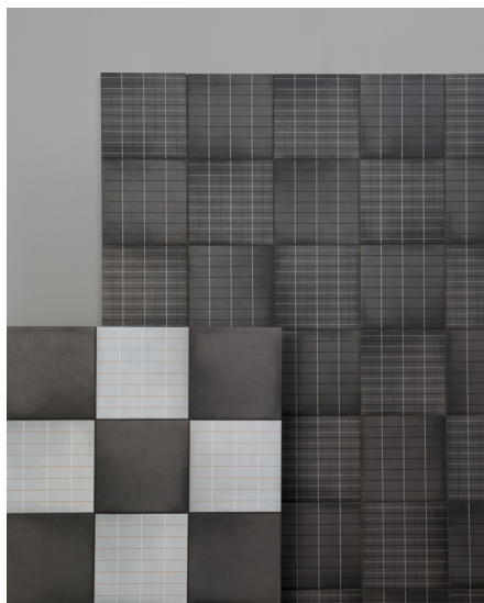
Aurore by Vincent Van Duysen

MUTINA CELEBRATES THE CLASSIC 20x20 CM TILE FORMAT WITH THREE NEW COLLECTIONS BY VINCENT VAN DUYSSEN, RAW EDGES, AND INGA SEMPÉ