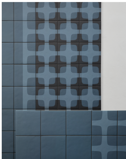
Betty by Raw Edges