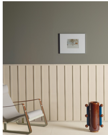
Motivo by Ronan Bouroullec

On the occasion of the International Exhibition of Ceramic Tile, Mutina will host a special event at its Fiorano Modenese headquarters, celebrating two leading figures in contemporary design and art: Ronan Bouroullec , with the project Variations on Ceramics , and Nathalie Du Pasquier , with the exhibition Coppie di Fatto e Altro . The exhibition opens on 22 September 2025 at Spazio Mutina and will be accessible to the public from 29 September .