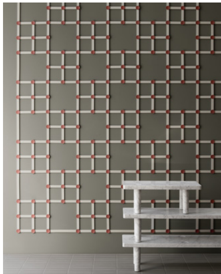
Aria by Ronan Bouroullec

MUTINA PRESENTS THREE NEW COLLECTIONS BY RONAN BOUROULLEC AND THE EXHIBITION COPPIE DI FATTO E ALTRO BY NATHALIE DU PASQUIER