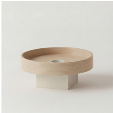
Vase: Chéng no.1 at Dawn h 18.5 x 44 cm (h 7.5 x 17.5 in)