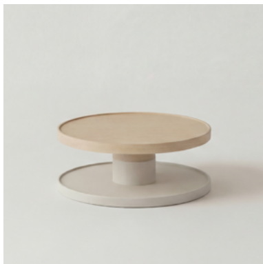
Stand: Shuāng at Dawn h 12.8 x 32 cm (h 5 x 12.5 in)