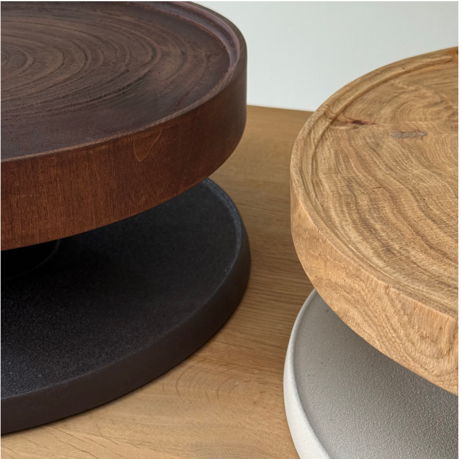
Neri&Hu Stand: Shuāng at Dusk, 2026 Stand: Shuāng at Dawn, 2026 detail