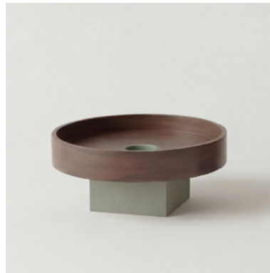
Vase: Chéng no.1 at Dusk h 18.5 x 44 cm (h 7.5 x 17.5 in)