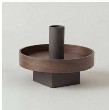
Vase: Chéng no.2 at Dusk h 33 x 44 cm (h 13 x 17.5 in)