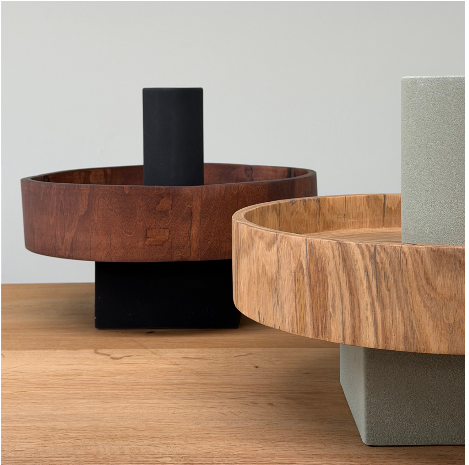
Neri&Hu Vase: Chéng no.2 at Dusk, 2026 Vase: Chéng no.2 at Dawn, 2026 detail