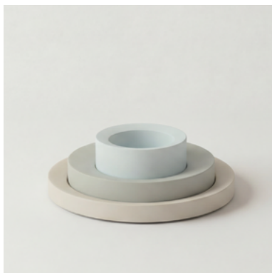
Tray: Bi at Dawn h 11.5 x 15.5 cm (h 4.5 x 6 in) h 70 x 23.2 cm (h 27.5 x 9 in) h 45 x 37.2 cm (h 17.5 x 14.5 in)