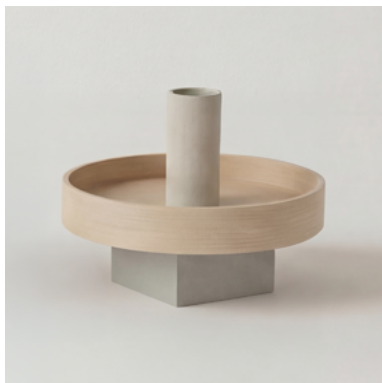
Vase: Chéng no.2 at Dawn h 33 x 44 cm (h 13 x 17.5 in)