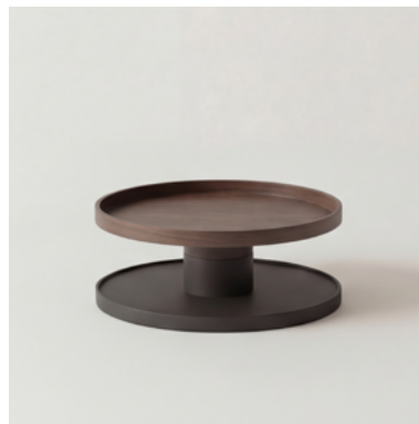
Stand: Shuāng at Dusk h 12.8 x 32 cm (h 5 x 12.5 in)