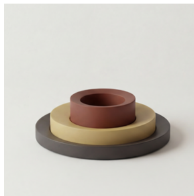
Tray: Bi at Dusk h 11.5 x 15.5 cm (h 4.5 x 6 in) h 70 x 23.2 cm (h 27.5 x 9 in) h 45 x 37.2 cm (h 17.5 x 14.5 in)