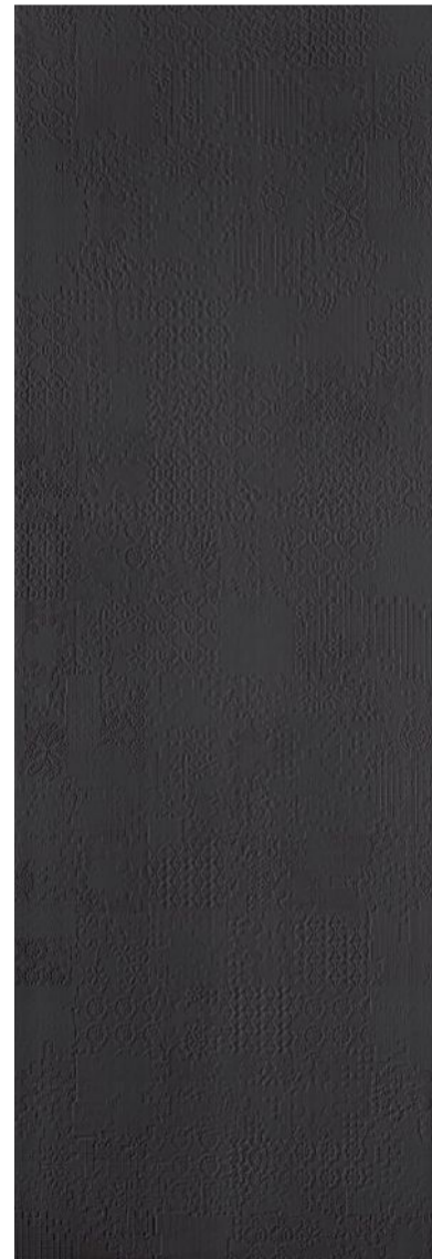
Déchirer XL Grafite 100-300 cm * 39"-118"