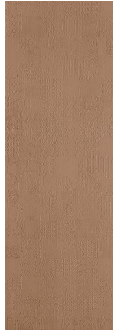
Déchirer XL Avana 100-300 cm * 39"-118"