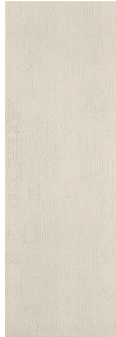
Déchirer XL Gesso 100-300 cm * 39"-118"